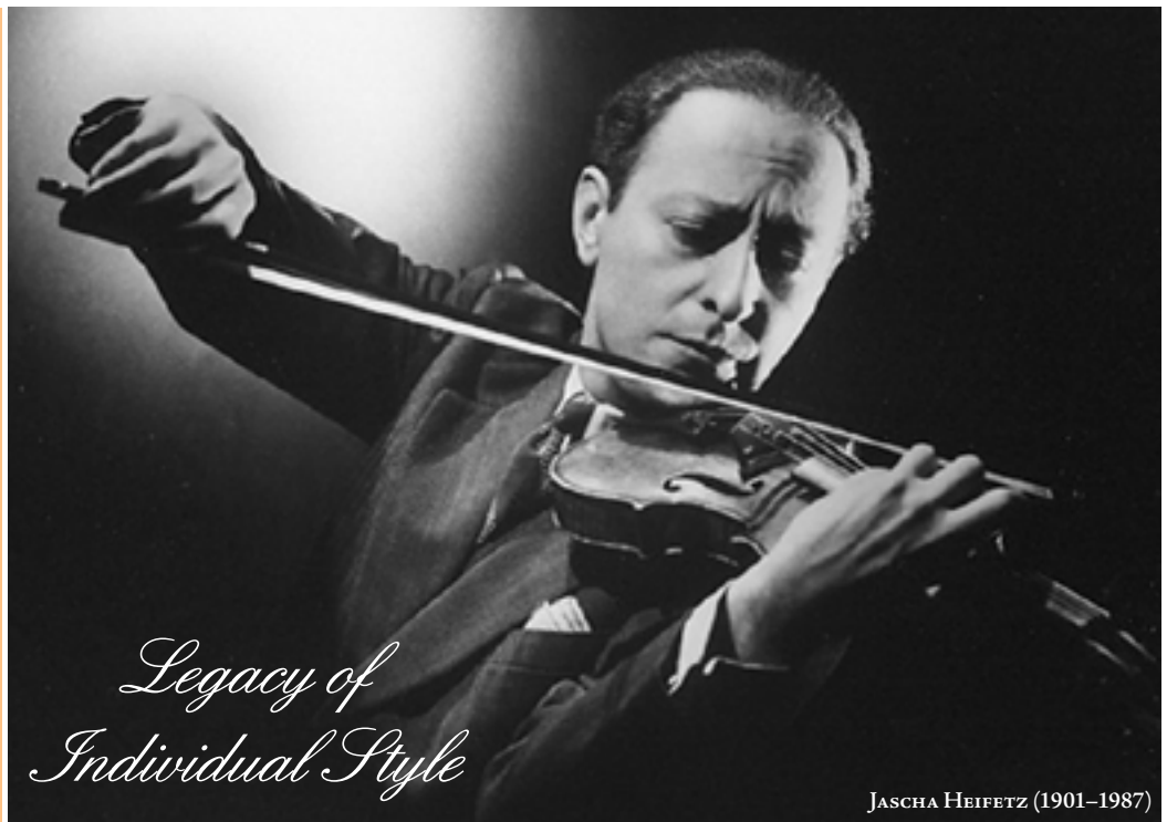
JASCHA HEIFETZ (1901–1987)